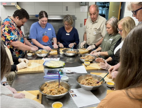
Learning to make egg rolls.

Marine Mills Folk School: Discover the joy of creating together through traditional arts and crafts, just up the hill! us the occasional use of their kitchen space!