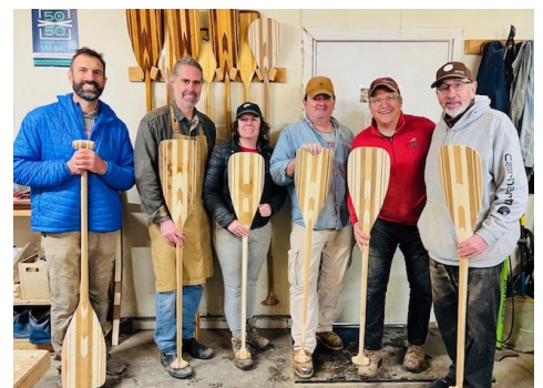
The ‘Build a Wooden Paddle’ class.