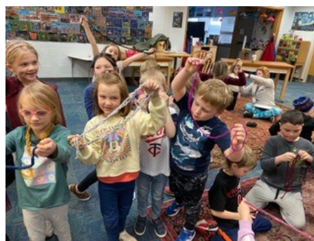
A ‘Spark’ crochet class for kids.